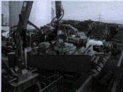
cross chain conveyor